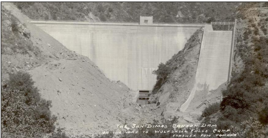
This image is a Frasher Post Card photo taken sometime before March 1938. We know this because Wolfskill Falls Camp was washed away in the 1938 flooding.