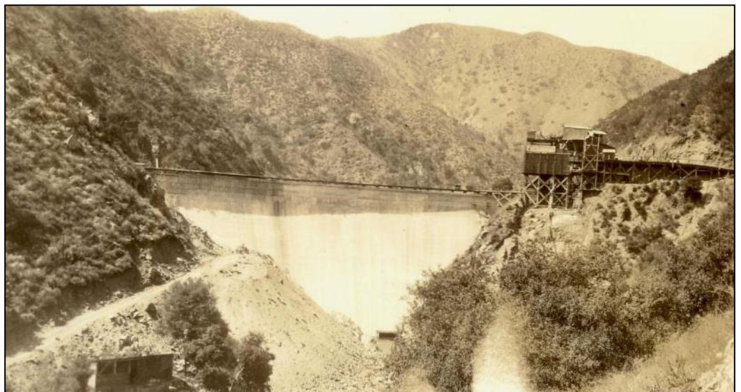
This downstream image was taken during construction before the spillway was completed.