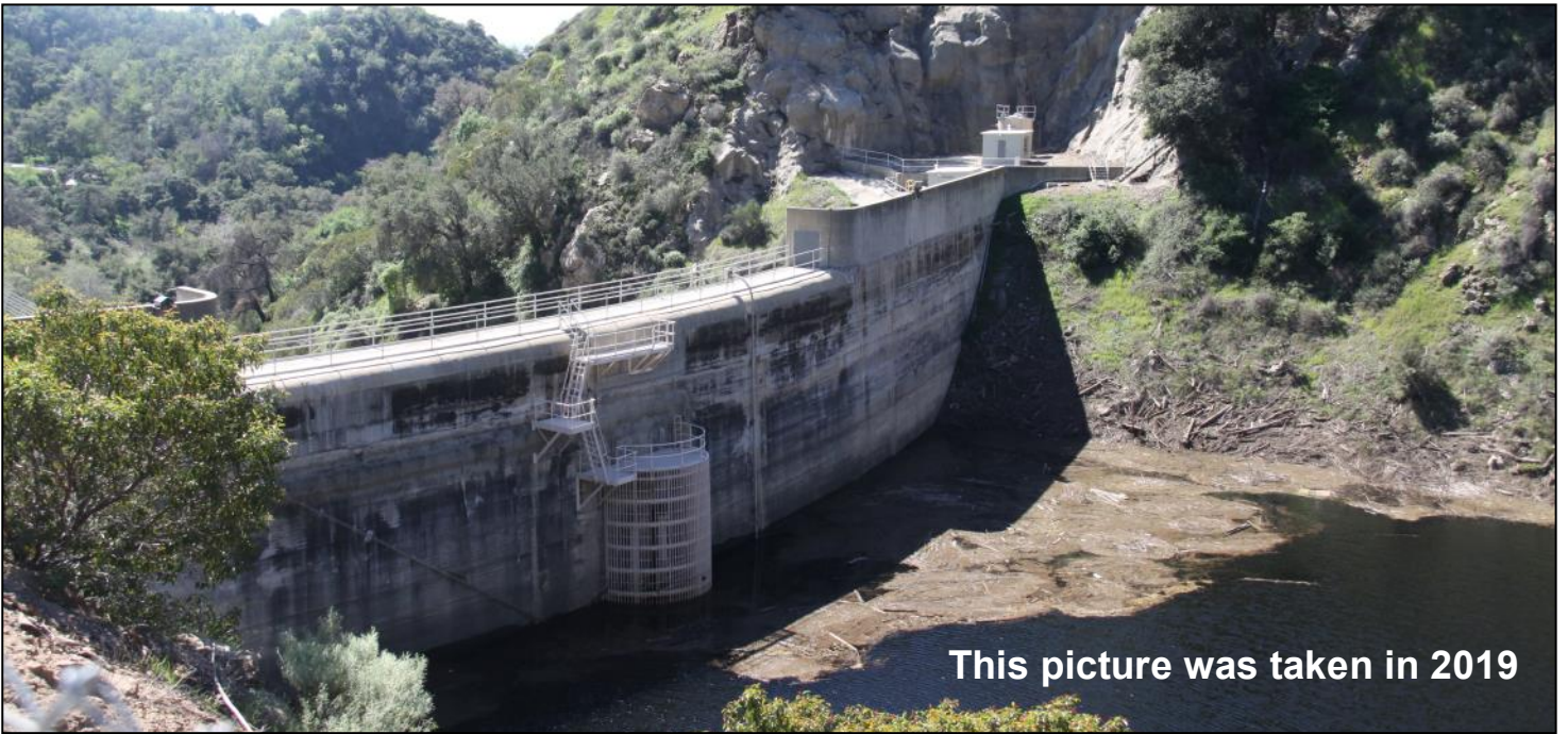
This picture was taken in 2019