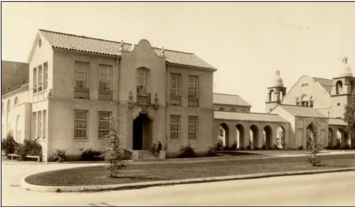
Bonita Union High School - Now Damien High